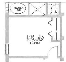
BEDROOM #1 OPTION

Living Area . . . . . 1,759 Garage . . . . . 499 Entry . . . . . 165 Lanai . . . . . 298